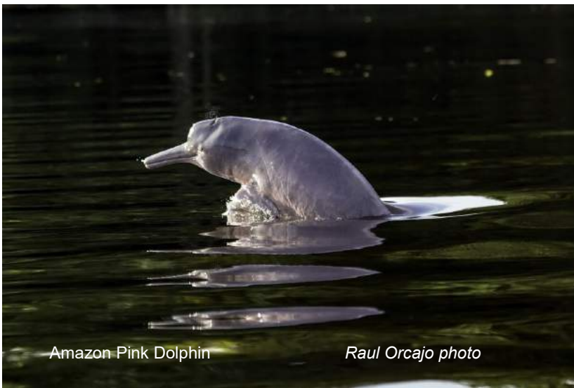
Amazon Pink Dolphin