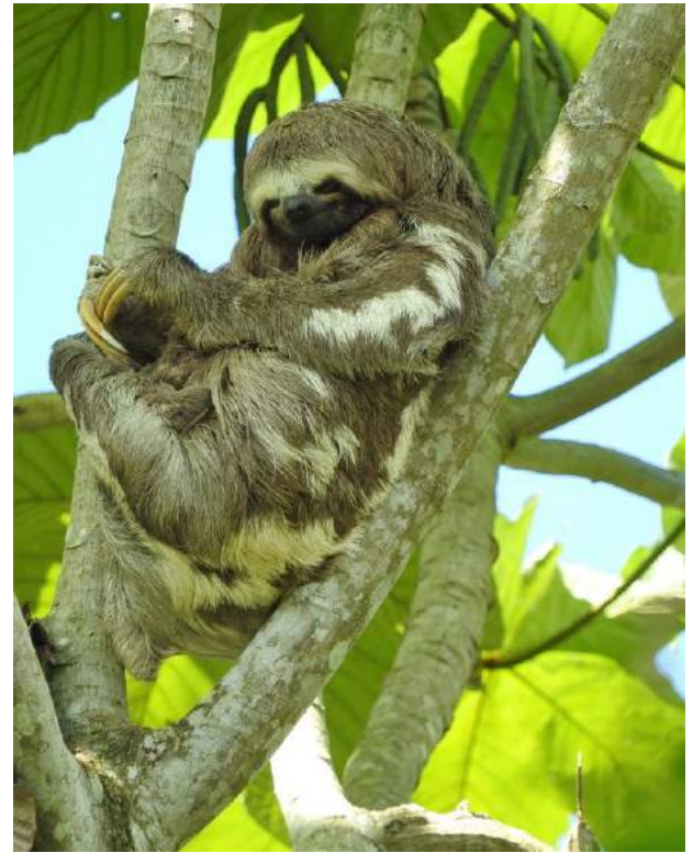
Brown-throated Three-toed Sloths

Accommodation: We will be based on the Dorinha from the 7th -16th. This is luxury wilderness travel: air-conditioned rooms with two bunks, private bathrooms, well-stocked bar, and outstanding food. Imagine watching the sunset from the upper deck of the boat with caiparinha (Brazil's national cocktail) in hand. There is a library of relevant books on board, and you may choose to stay on the boat as an alternative to any of our many outings.