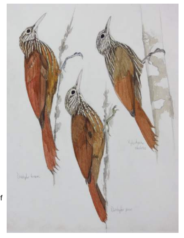
Amazonian Woodcreepers Micah Riegner illustration

Accommodation : We will be based on the Dorinha for the entire journey. This is luxury wilderness travel: air-conditioned rooms with two bunks, private bathrooms, well-stocked bar, and outstanding food. Imagine watching the sunset from the upper deck of the boat with caiparinha (Brazil's national cocktail) in hand.