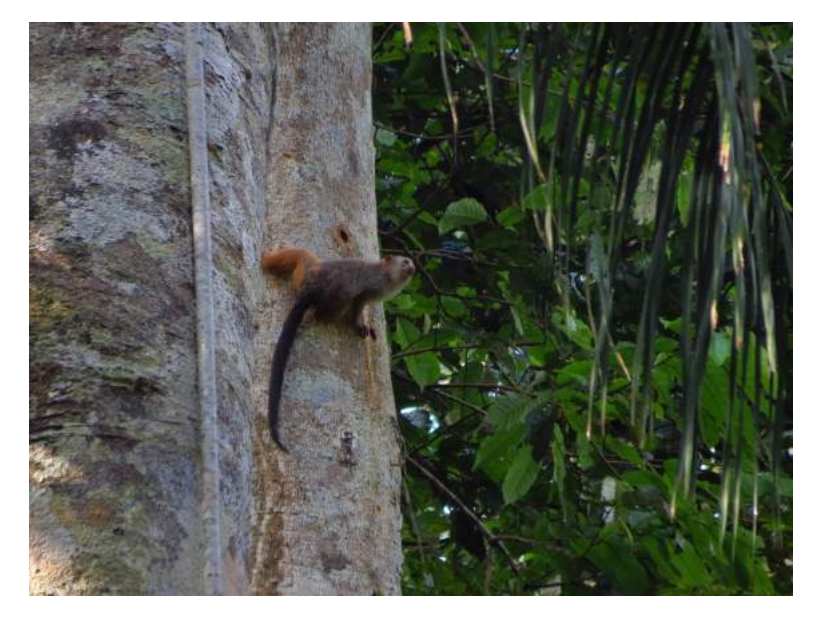
Activities We will be doing early morning and afternoon excursions either in canoes or on trails. The terrain around Maues is steep, and some of the trails require a fair amount of stamina, but canoe options also exist at such times. At nights we will do outings to look for nocturnal mammals and set up mist nets to capture bats. Your leaders are happy to arrange special talks, sketching sessions, etc.

Timing The boat will leave on June 1st (and will return on the afternoon of the 13th. There will be options ($25 per person) to visit a canopy tower in Reserva Adolpho Ducke on the mornings of the 1st &14th. This is the way to get high in the tropics! Instead of looking up into the bright sky through tall trees, you are up there with the birds, an experience to treasure.